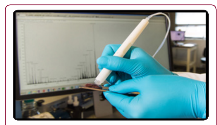
Figure 1: The MasSpec Pen while in operation.

Nevertheless, in recent time, mass analyzers are vividly using as cancer detecting tools for its accurate molecular label interpretation. Jialing Zihang and his team dedicatedly worked on improving mass analyzer's effectiveness by redefining and modifying its tool. Currently used Desorption electrospray ionization MS Imaging has certain limitations like, it cannot be used in fresh tissues and invivo analyses. The biggest drawback of this model is its dependency on tissue damage to produce molecular ions, which could be constrained & painful for patients. To circumvent all the associated problems with the molecular oncological analysis. Jialing Zihang and his team developed a new device, which is connected to a mass analyzer. They named this device as "MasSpec Pen".