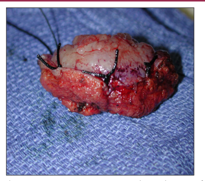
Figure 3: The specimen is removed and sent for frozen section analysis. Stretching and distortion of normal architecture are prevented by sutures.