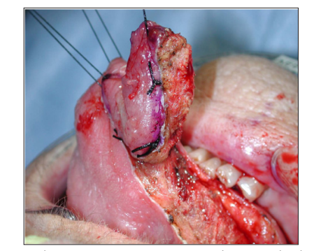
Figure 2: Oral tongue cancer is excised using the horizontal mattress sutures to define the surgical plane. Sutures remain intact on specimen side.

Anterior traction is applied using the tethering sutures for exposure. Resection is performed using electrocautery to dissect along the medial aspect of the mattress sutures. A surgical plane is maintained without undermining of surrounding normal tissue of either the specimen or the residual tongue (Figure 2). The mattress suture prevents tissue stretching and distortion during manipulation and maintains both specimen orientation and integrity for pathological analysis [5]. In most instances of early tongue cancer, the surgeon does not need to manually manipulate the tongue. The tumor is removed having uniform clean edges with the mattress sutures intact on the specimen. Following removal of the specimen, tissue is oriented for frozen section and transported to the pathologist with the mattress sutures intact. Tissue splaying and shrinkage of margin distance that occurs with retraction and manipulation are reduced by these sutures which also maintain anatomic integrity of the excised specimen (Figure 3).