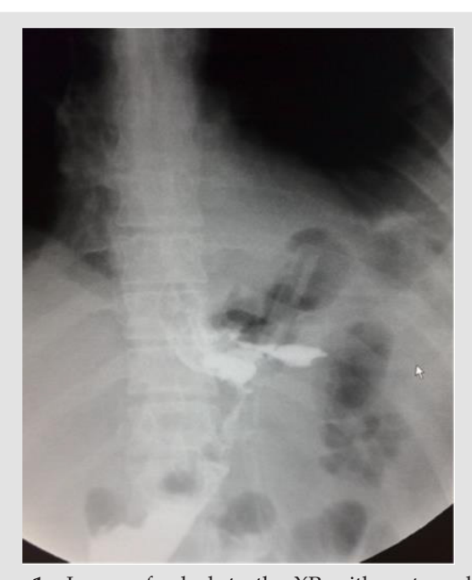
Figure 1: Image of a leak to the XR with water-soluble contrast medium (our observation).

The average age of patients who submitted SLL was 28 years (range 19 - 47), the average BMI 50 kg/m² (range 40 - 56) (Table 1). All leaks showed up at the next portion of the stomach, below the gastroesophageal junction. No deaths have occurred. Diagnosis of SLL was carried out in an average period of 37 days (range, 1-121). Symptoms of onset were: hyperpiressia with chills (n=8), abdominal pain (n=2) nausea and vomiting (n=1). Diagnosis was made with abdomen CT with c.m. (n=6), Esophagus-stomach XR with water-soluble c.m. (n=3) (Figure 1). In one case the diagnosis was made by means of routine radiological control, without having specific symptoms and/or signs. A multidisciplinary approach was used for all patients, including fasting, total parenteral nutrition and antibiotic therapy.