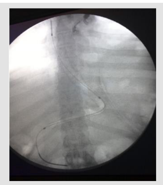
Figure 3: Endoscopic positioning of a megastent.

mesh that soon anchors it even more and reduces the risk of migration.