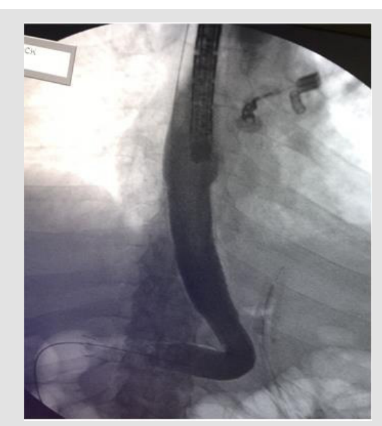
Figure 4: Endoscopic positioning of a megastent.

The device is left on site for at least four weeks, but no later than six for the risk of tissue hyperplasia that would hesitate in greater difficulty during removal. Prosthesis often induces nausea, vomiting and restrosternal pain especially in the early hours and early days so much that it is little tolerated by patients [36]. There is a risk of migration and relocation that varies from 18% to 33% depending on the case [18,37].