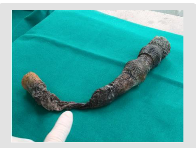
Figure 2: Stent removed after 6 weeks stenotized in its distal part (our observation).

In all cases of late SLL, we placed a guided CT drainage to drain the perigastric purulent collection. In a case it was necessary a re-surgery conducted in laparoscopy for the persistence of hyperpiressia and the appearance of signs of sepsis despite the drainage placed under CT guidance. During the intervention, washing of the perigatric area and drainage of the collection was carried out. Conservative treatment (fasting, parenteral nutrition, antibiotic therapy, nasogastric sondino) was used in one patient. Endoscopic positioning of megastent was used in seven patients underwent with (n=1) or without (n=6) pylon expansion. In one case it was necessary to place a second stent after 4 weeks to persist, although reduced, of the leak and after the removal of the second stent the leak had healed. In another case it was necessary to replace the stent by the appearance of disphagia after two weeks, the removal stent had a stenosis in its distal part (Figure 2). Five patients who had a stent placed obtained a leak healing in an average time of 42.8 days (range, 28-84).