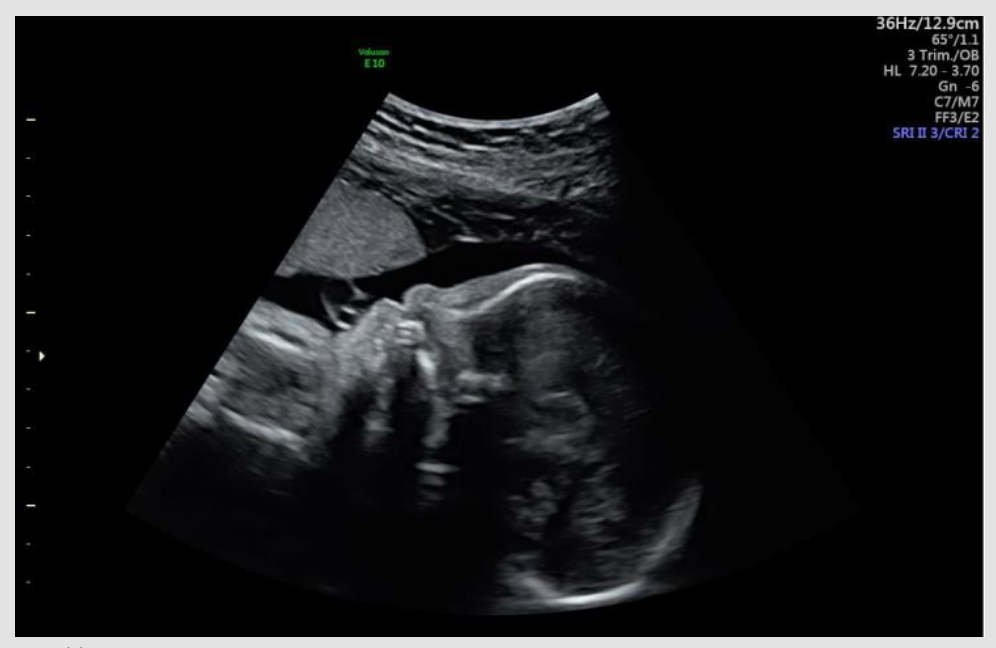
Figure 2: Absent nasal bone.