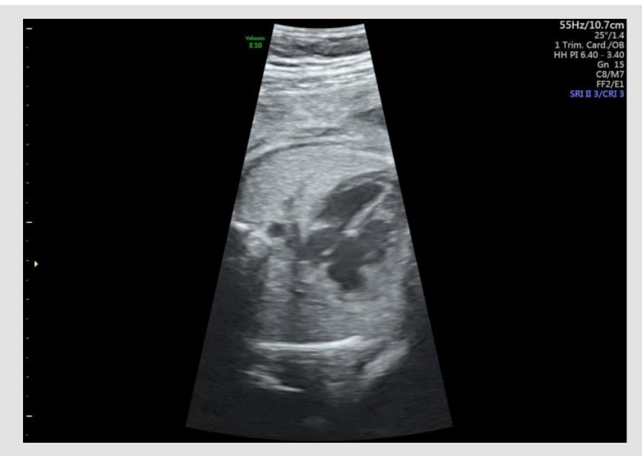
Figure 1: Ultrasound images show complete atrioventricular septal defect.

performed to detect other microdeletions related to this symptom and to independently confirm the QF-PCR result. Prental BoBs test showed the presence of three copies of the chromosome 21, two copies of chromosome X and one copy of chromosome Y with no detection of microdeletion. This result is corresponding to dual DS-KS. Cytogenetic investigation of the amniotic fluid at 30th week of pregnancy was performed with Amnio max complete media and G-banding of chromosomes. The results were described according to the International System for Human Cytogenetic Nomenclature (ISCN 2016). The cytogenetic analysis revealed a case of double aneuploidy with the karyotype 48, XXY, inv (9) (p11q13), +21 (Figure 3).