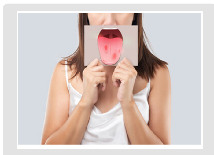
Figure 2: Erythroplakia.

Leucoplakia: This is defined as a white patch that cannot be characterized as any other disease clinically or pathologically, characterized as any other lesion clinically or pathologically. About 90% of these lesions show cellular dysplasia or malignancy. Any abnormal finding on oral visual examination should be considered as positive and patient should be managed according to screening and management algorithm for oral cancer. Visual examination as part of a population-based screening program reduces the mortality rate of oral cancer in high-risk individuals; in addition, it could result in diagnoses of oral cancer at an earlier stage of disease and improvement in survival rates across the population as a whole population. Oral cancer is predominantly a loco-regional disease that tends to infiltrate adjacent bone and soft tissues and spreads to the regional lymph nodes in the neck. Distant metastasis is uncommon at the time of diagnosis. A thorough inspection and palpation of the oral cavity and examination of the neck is mandatory. CT and MRI imaging are widely used to assess the extent of involvement of adjacent structures, such as bones and soft tissues (Figure 3).