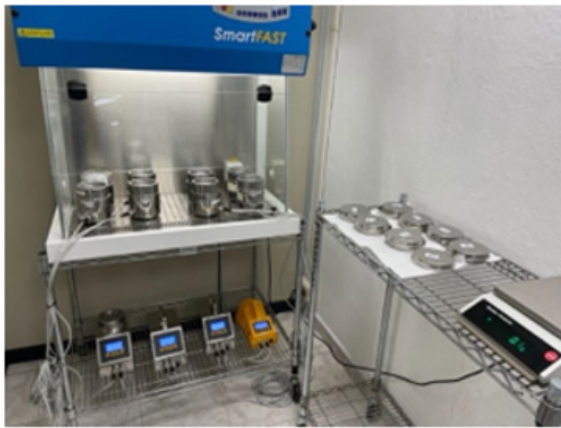
First part of the test to reduce the moisture of the nutrient agar

different times (e.g.: 1 hour = 1500 litres, 2 hours = 3000 litres, etc.) at ambient temperature (+21,0°C.; 1001 Hp; 40% Humidity). The purpose is to evaluate and register the loss of humidity in aseptic conditions (Figure 1).