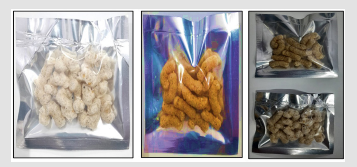
Figure 2: Samples prepared in different treatments and packed in LDPE bags.

A panel of 28 semi-trained judges from University of Life Sciences and Technologies demonstrate millet-based extruded snacks using a ranking test. Each sample is arranged in groups of three on glass plates to evaluate appearance, texture, taste, and aftertaste using an evaluation form as this form is generated through Fizz Acquisition 2.51 software. Warm black tea was used for taste neutralization between samples. The panelists ranked the samples as per most liked=1 to least liked=8 and the recorded results were calibrated as the summation of ranks for each sample (Figure 2).