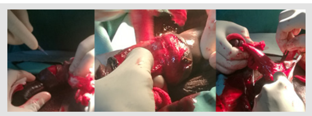
Figure 2: Circular incision and penile stripping.

Exploration of the penis revealed an injury in the corpora cavernosa on the right distal to the urethral meatus approximately 2.5 cm away. This was repaired with Vicryl 0, followed by a sealing test using 0.9% serum saline and removal of the tourniquet (Figure 3). After exploring the corpus cavernosum, we started the exploration of the urethra using a Nelaton catheter 16, which allowed us to identify and evaluate the anterior urethral injury