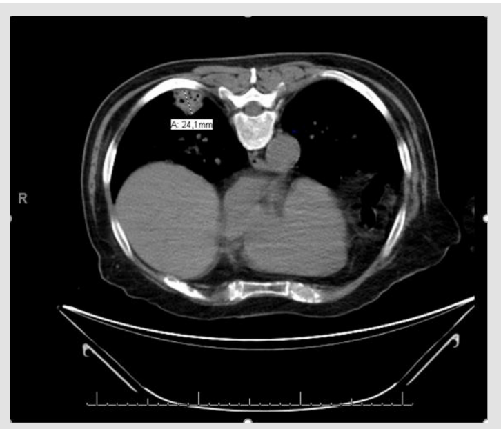
Figure 3: Syringocystadenocarcinoma metastasis: Computerized tomography that shows nodular 2,4 cms-leght pulmonary lesion at fourth month of intervention.

differentiated glandular malignancy focally positive for TTF-1, which was not specific for adnexal tumors nor for lung adenocarcinoma. In order to elucidate diagnosis, the first pathological sample (scalp) was reviewed. Because of the permeative and gradual malignancy pattern observed there, as well as its arising over a preexisting nevus sebaceous of Jadassohn, lung adenocarcinoma was rejected as the primary origin of the clinical chart. The patient refused adjuvant treatment and died eight months after surgical excision.