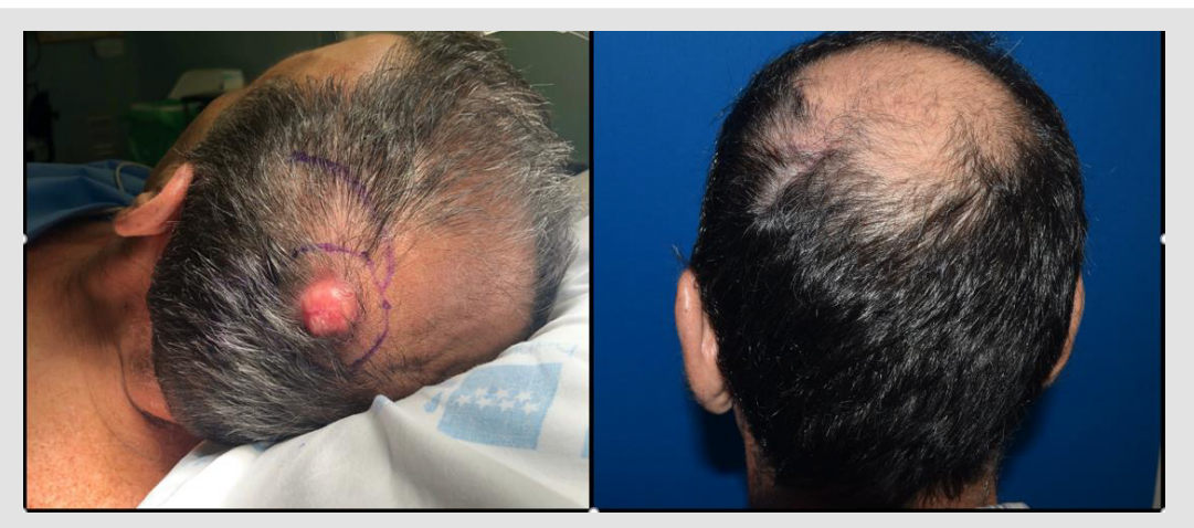
Figure 1: Syringocystadenocarcinoma papiliferum: A. Scalp lesion at surgery room and B. Second month postoperative aspect.

perineural infiltration and a high rate of mitosis. Immunoreactivity was positive for p63/CK7/34-betae12/EMA, being negative for CEA/S100 (Figure 2). The previous description corresponded to a SCACP that respected surgical margins of resection arising on a preexisting nevus sebaceous of Jadassonhn. Four months after surgery, the patient consulted because of a painful nodule on the left scapular region and marked constitutional syndrome.