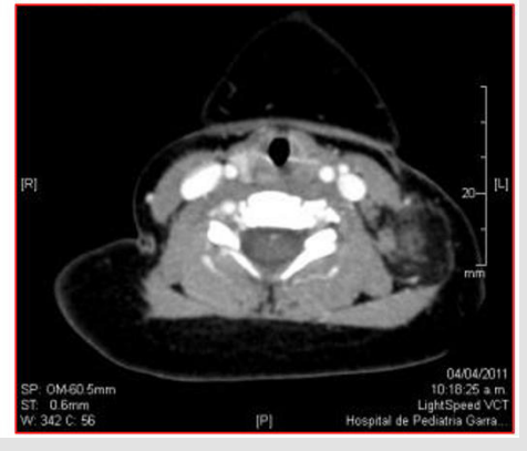
Figure 1: CT Scan showing a big, round, fat-Hounsfield-density, lobulated lesion.