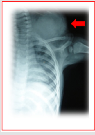
Figure 3: Chest X-Ray of a toddler with a giant cervical mass (red arrow). The tumor doesn't involve bones only soft tissue without invasion of the thorax.