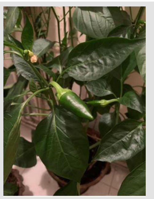
Figure 3: Heated Scallop shell powder treated peppers were also firm, well developed, and flavorful.