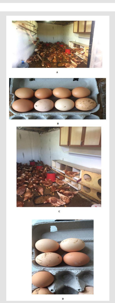
Figure 4: Chickens and their eggs with heated scallop shell powder added to their daily diet.