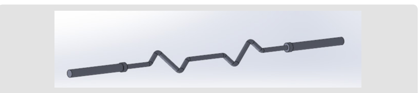
Figure 1: Proposed Shoulder Saver Bench Bar.