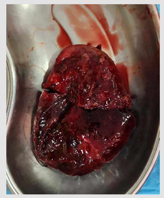
Figure 3: Cholecystectomy specimen showing gangrenous cholecystitis.

Figure 2: Abdominal CT scan showing severe gall bladder distention with thickened wall.