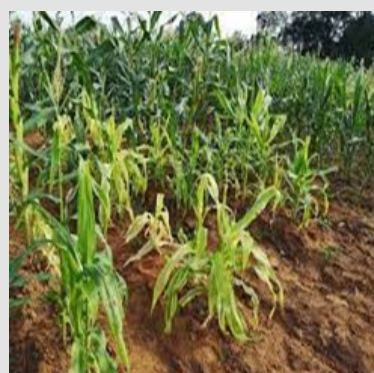
Figure 3: Control land without treatment