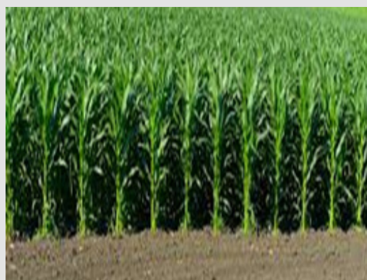
Figure 4: Farmland treated with Activated Gliotoxin