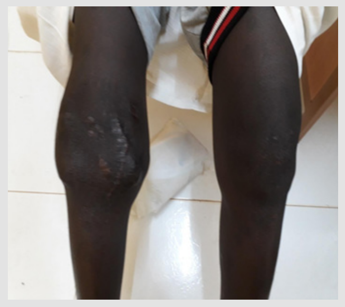
Figure 1: Shows bilateral knee swelling.