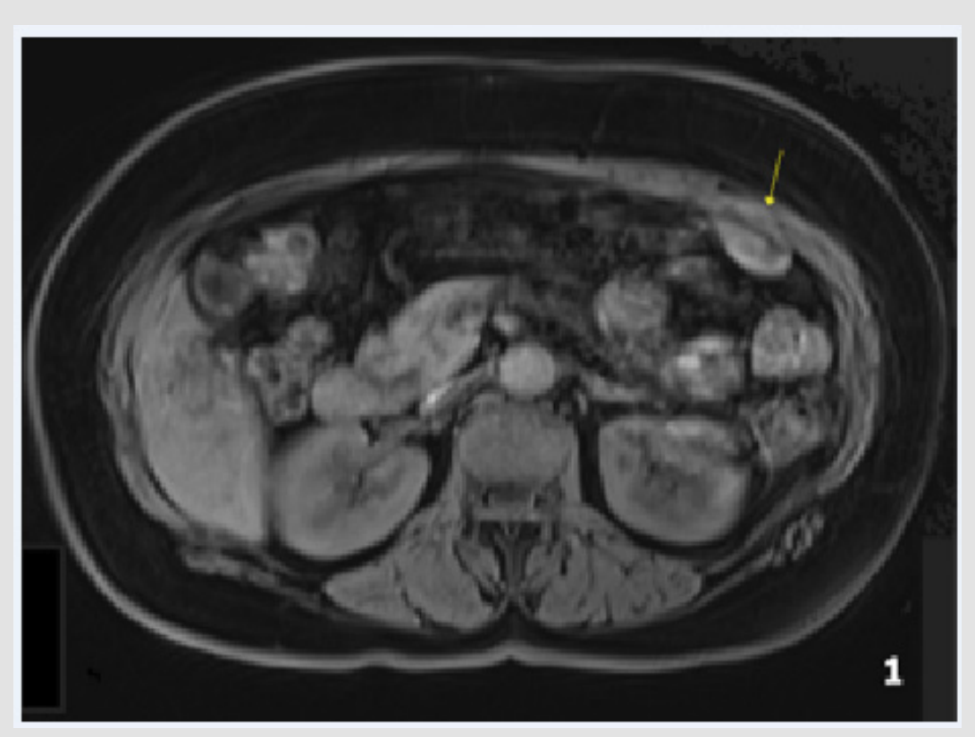
Figure 1: 1-Abdominal MRI done preoperatively showing the abdominal wall lesion (yellow Arrow).