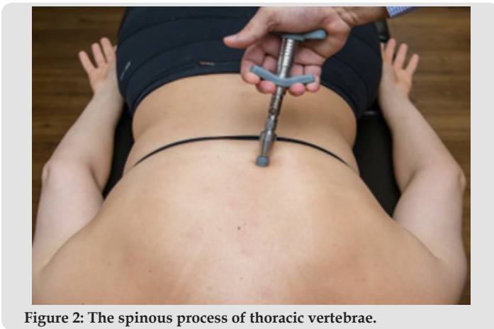
Figure 2: The spinous process of thoracic vertebrae.