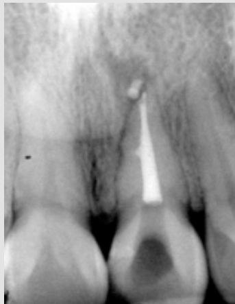
Figure 3: First follow-up appointment at 8 months.

Reduction of the apical and lateral lesion is observed. Reduction of the cementum of the apical PUFF is observed (Figure 3).