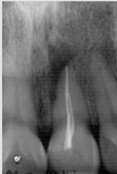
Figure 1: OD 21 previously treated. Radiolucent lesion in the apical and mesial third. Deficient obturation of the root canal.

A 30-year-old female patient presented for consultation on November 15, 2004, with a diagnosis of symptomatic apical periodontitis, previous failed treatment of dental organ (OD) 21 (Figure 1).