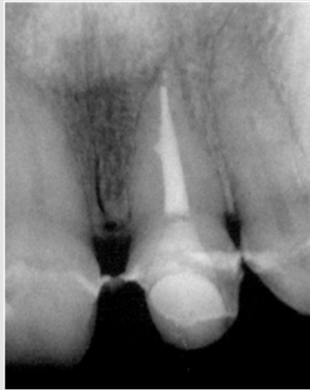
Figure 4: Second follow-up appointment at 15 years.