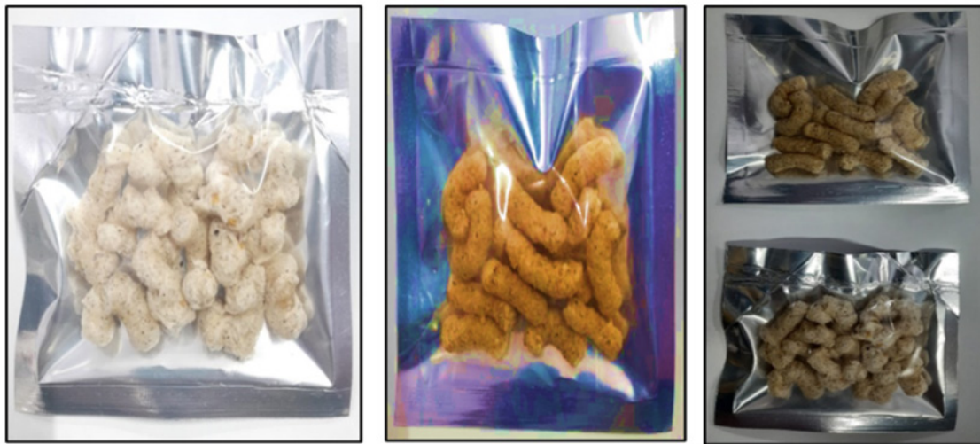
Figure 2: Samples prepared in different treatments and packed in LDPE bags.

A panel of 28 semi-trained judges from University of Life Sciences and Technologies demonstrate millet-based extruded snacks using a ranking test. Each sample is arranged in groups of three on glass plates to evaluate appearance, texture, taste, and aftertaste using an evaluation form as this form is generated through Fizz Acquisition 2.51 software. Warm black tea was used for taste neutralization between samples. The panelists ranked the samples as per most liked=1 to least liked=8 and the recorded results were calibrated as the summation of ranks for each sample (Figure 2).