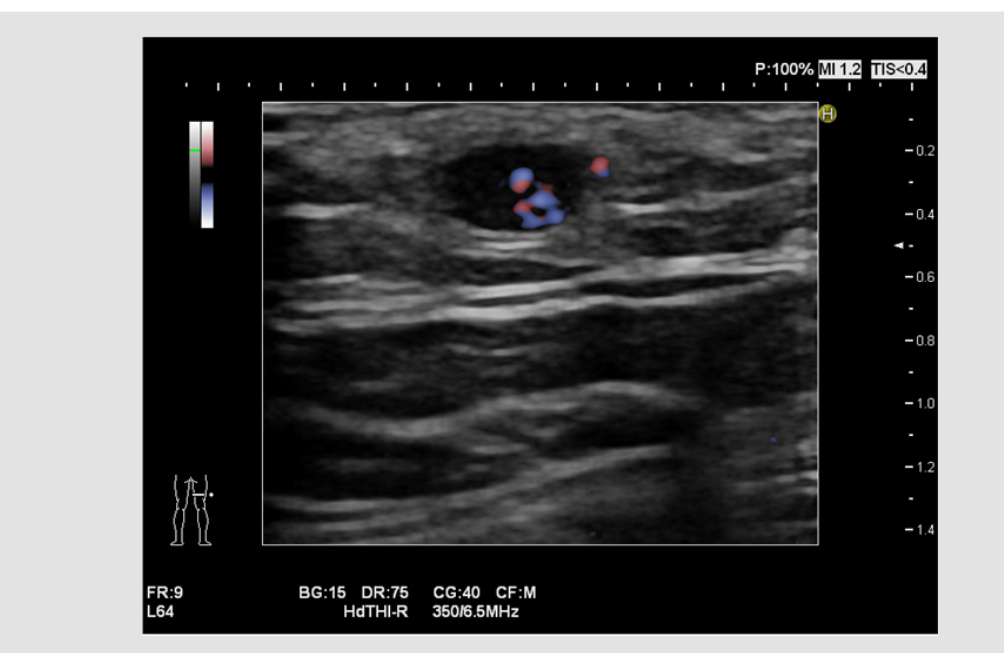
Figure 1: Angioleiomyoma on the lower extremity in a 69-year-old female. Central and peripheral blood flow signals were detected on Fine Flow.

speed and high resistance profile on spectral Doppler analysis [28], spectral Doppler analysis for blood flow velocity is very important in differential diagnosis between benign and malignant lesion. Central and peripheral blood flow signals were detected on Fine Flow in ALM on the lower extremity pathologically confirmed in a 69-year-old female (Figure 1). Little flow in central and adjacent flow in periphery were observed on power Doppler US. Peripheral flow on power Doppler US was suggested to correspond to adjacent vessel (Figure 2).