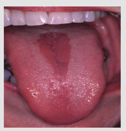
Figure 1: Clinical Appearance in Median Rhomboid Glositis.

diabetes mellitus, as well as candidal infections. Aim of this study is to review association MRG and relationship with predisposition factors, such as aging, dominance of men in prevalent, smoking habits, denture wearer, and systemic conditions especially diabetes mellitus [3].