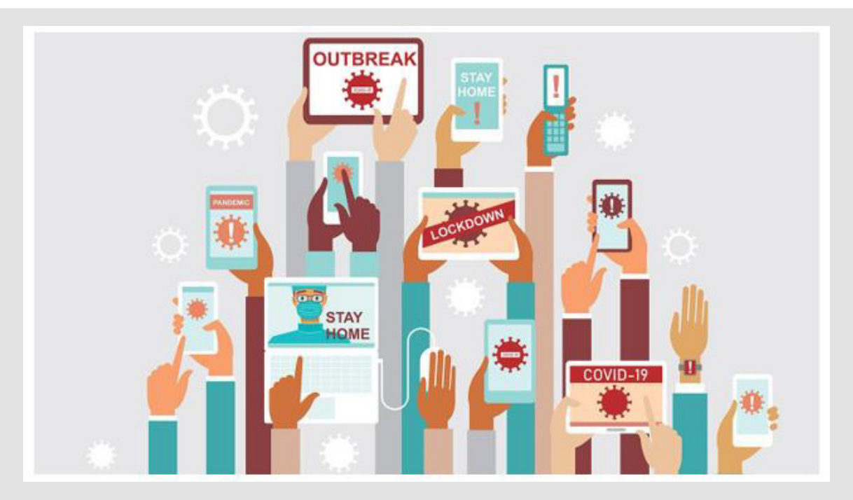
Figure 2: Infodemic of COVID-19.

COVID-19 has become the definitive disruptor due to the characteristic property of reforming the work lives, family dynamics, and finances of people. Confronting the media exposure problems which can cause psychological and emotional stress to an individual's relationships [10]. It is important to ensure the true prevalence of COVID-19. The majority of the people only experience COVID-19 through social and mass media ever. As 24/7 coverage of multiple media resources makes it looks like the pandemic is ubiquitous for the lives [17]. The research also demonstrates that the perceptions of the proportion of negative thoughts of viral infection are influencing heavily by due to reading and watching social media news. World Health Organization (WHO) coined a term by "Infodemic" that refers to spreading the disinformation on the COVID-19. It makes it hard for people to find a resolute resource for obtaining exact information as people are encountering a mess of coronavirus reading data on social media [19] (Figure 2).