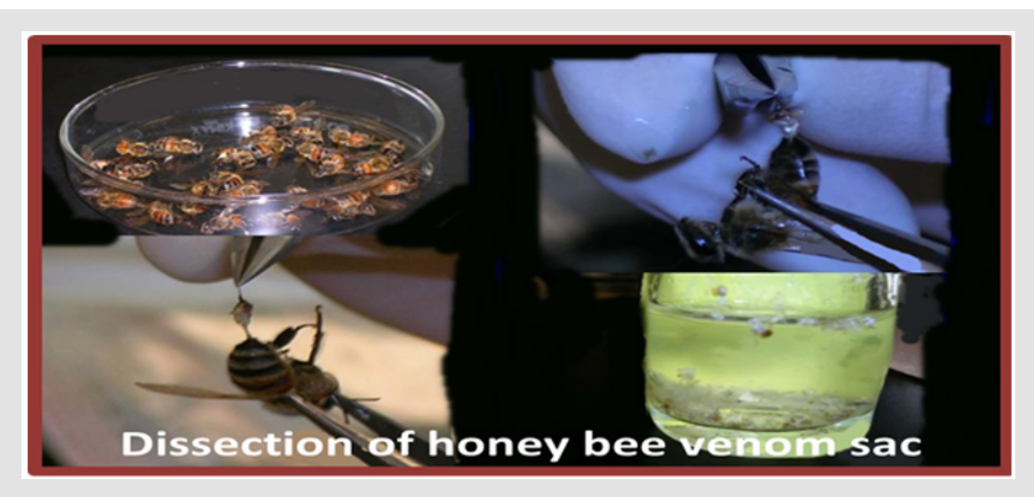
Figure 1: Dissection of Honey Bee Venom Sac.

An enzyme that is supposed to facilitate the spreading of other venom components into tissues, potentially assisting in their impact (Figure 1).